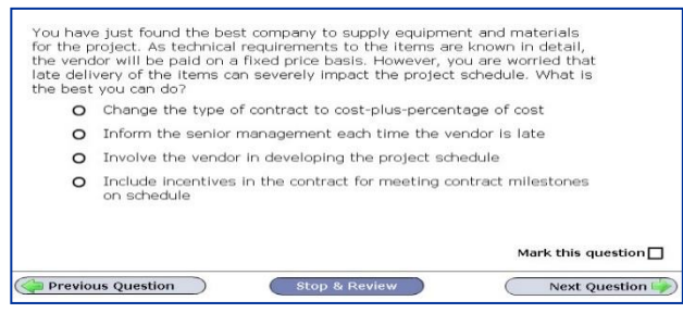
Over 1000 questions to evaluate in details the candidates' knowledge.

PMI, PMP and PMBOK are registered marks of the Project Management Institute, Inc.